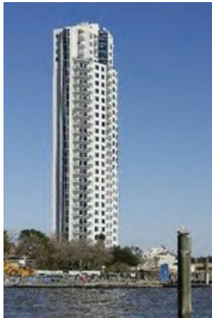
Endeavour Clear Lake condos, Pasadena, TX

Posted by Alex Finkelstein 03/01/10 4:09 PM EST